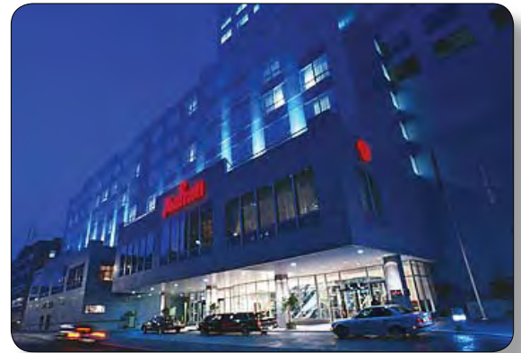
New York Marriott at the Brooklyn Bridge 333 Adams Street Brooklyn, NY 11201 Tel: 718-246-7000 or 888-436-3759

To reserve your room at the VSLive! special attendee rate of $199 per night , please call 888-436-3759 and reference group reservation code VSLIVE . Rooms are subject to availability and must be reserved by August 21, 2006 , so book early to lock in your discounted rate.