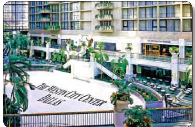
Westin City Center 650 North Pearl Street Dallas, Texas 75201 Tel: 214-979-9000 or 866-837-4246

To reserve your room at the VSLive! special attendee rate of $189 per night , please call 866-837-4246 and reference group reservation code VSLIVE . Rooms are subject to availability and must be reserved by October 30 , so book early to lock in your discounted rate.